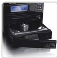
Hot Swappable Tray