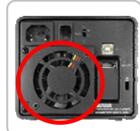
Less Noisy Fan

Coming with piano varnish tray module, GR3630-2S-WBS2 equipped with RAID controller supporting mirroring RAID for data backup. It supports striping as well which enables to enhance data access efficiency. GR3630-2S-WBS2 provides a secure and reliable storage space for individual workers and workstation use.