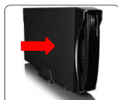
Heat-dissipating Aluminum Case