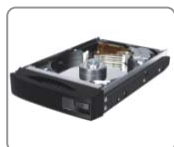
Removable Tray Design

External Storage Enclosure with High Performance & Big Capacity