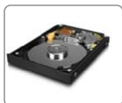
Removable Tray Design