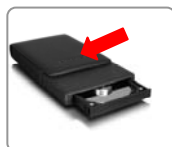
Protected Leather Bag

J1-1S-B3, a 2.5" HDD enclosure with latest Super speed USB 3.0 interface and gives a theoretical transfer rate up to 5 Gb/s. It reveals optimum access efficiency from SSD and allows user to actually save time from the high speed performance and further enhance convenience of mobility.