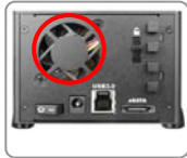
Low Rotation Fan